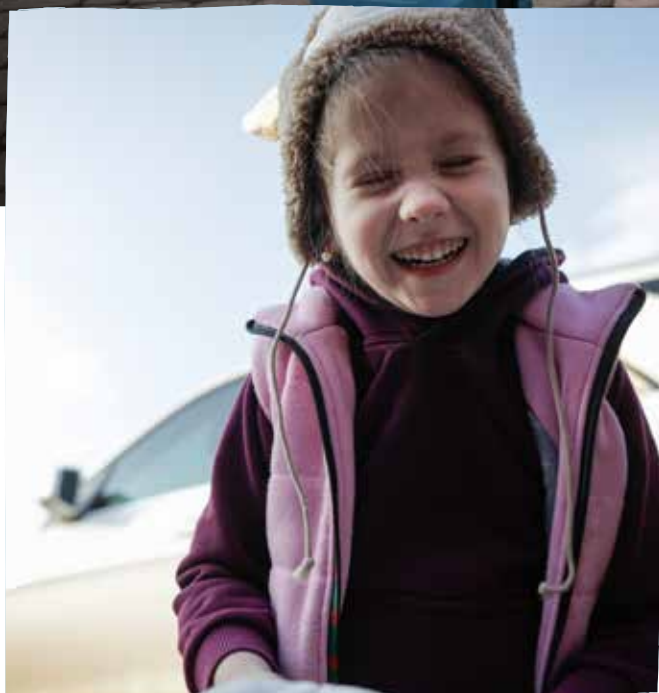
Plan International / George Calin

More than 1.8 million children have crossed Ukraine's borders, according to the UN. Since the conflict started, 75,000 children have become refugees every day. That means one child in Ukraine becomes a refugee almost every single second.